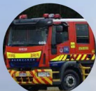
Foxton Beach Volunteer Fire Brigade