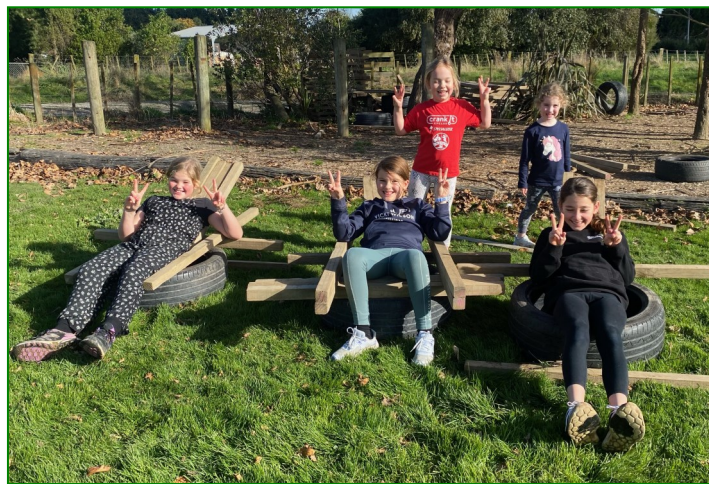
Making the most of the sunshine!