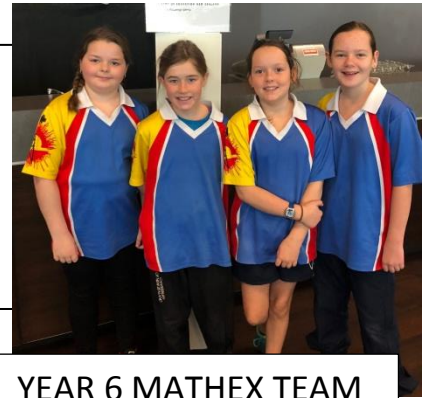
YEAR 6 MATHEX TEAM