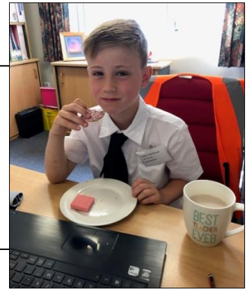
'Principal for the Day'